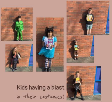
Kids having a blast in their costumes!

Year 3 have had another busy week this week. In English, we have been reading the Iron Man and creating newspaper reports using direct speech and reported speech. I was really impressed with their writing- well done everyone. In Maths, they looked at subtracting three-digit numbers using the column method. For world book day, we enjoyed reading Harriet versus the Galaxy and creating our very own front covers.